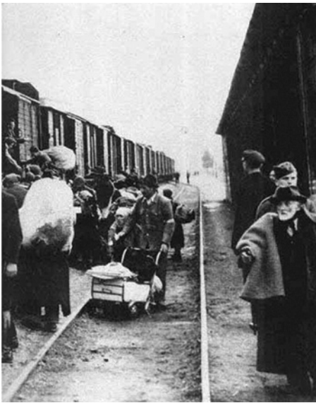
Saving the scrolls during WWII.