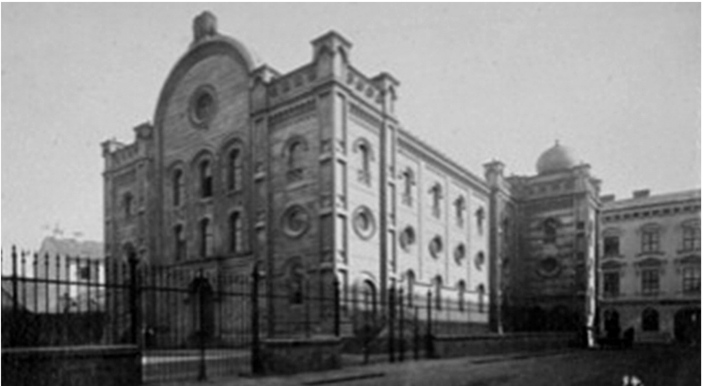
Synagogue in Brno, in the region where our scroll probably originated

The March 24 event will mark both the successful