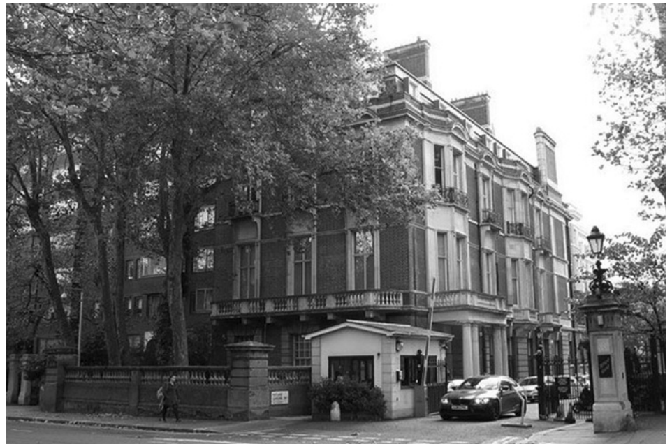
The Czech Memorial Scrolls Trust Museum, Rutland Gardens, London

MST headquarters in London displays a permanent exhibit relating the history of the scrolls and the Czech-Jewish communities from which they came. It also serves as a resource for information relating to each scroll, including the scroll’s specific history.