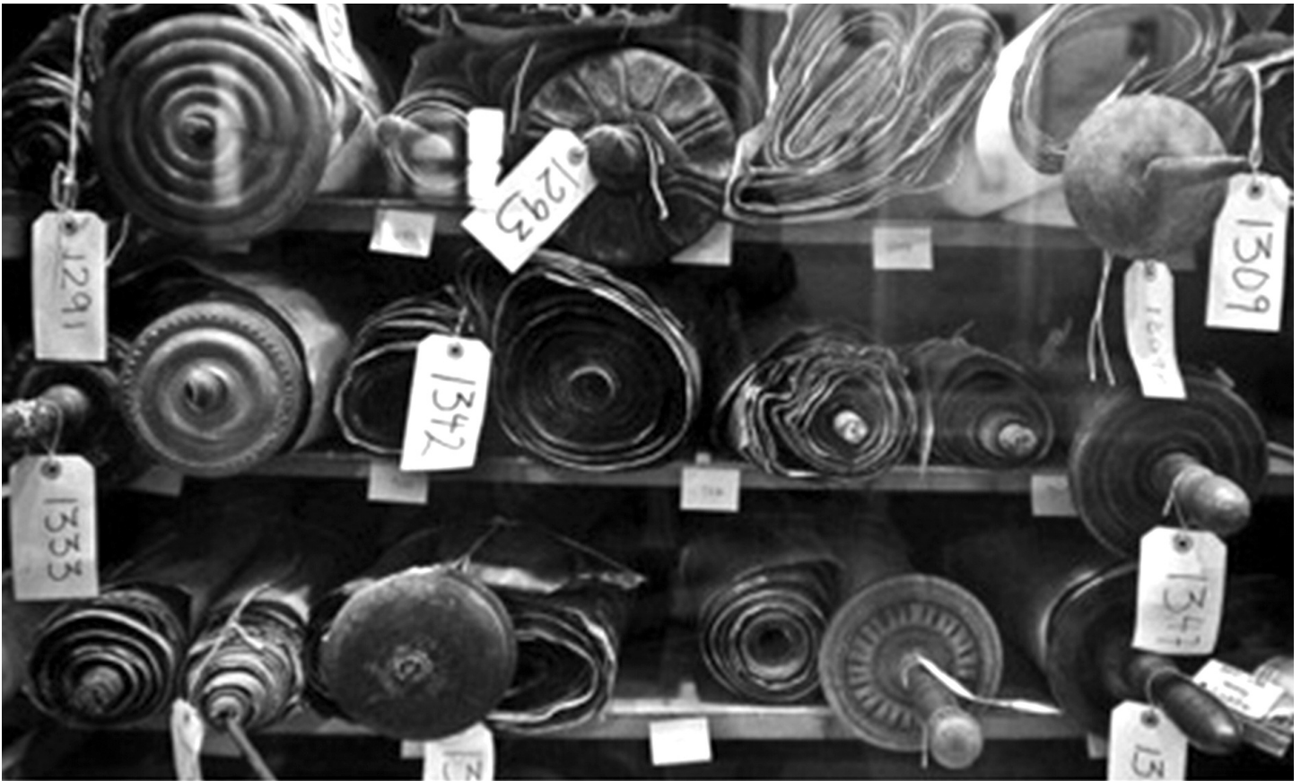
Czech scrolls saved from the Holocaust, as stored in Westminster Synagogue after have been purchased from the Communist government in Czechoslovakia.

control of the museum, and the scrolls were housed in conditions detrimental to their longevity.