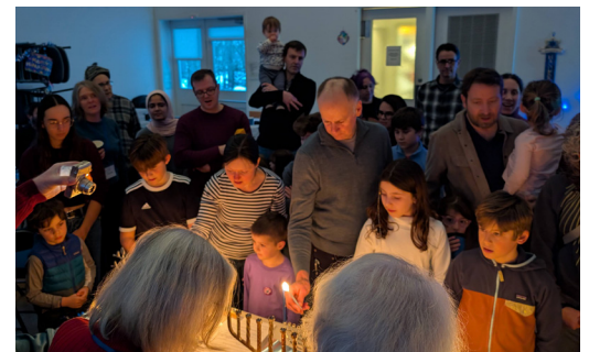
UVJC celebration of the first night of Hanukkah, 12/14/2025.