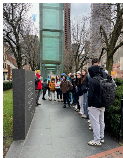
Above: Photos from the Jew Crew trip to Boston.