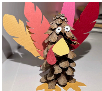
Thanksgiving seder pinecone turkey art project.